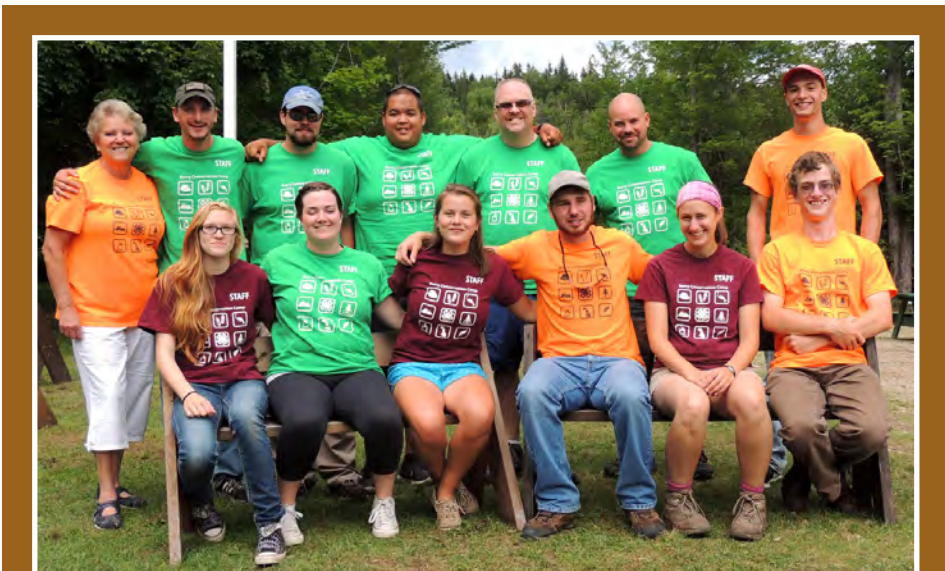
A big THANK YOU to the 2015 Barry Camp staff. Their hard work, caring and dedication makes camp a special place that fosters a connection to the outdoors and creates memories that last a lifetime.