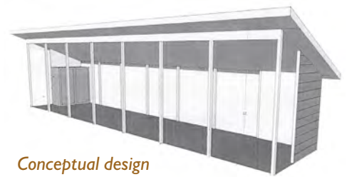
Conceptual design for the covered archery range.

“wish list” for several items needed to complete the new range, which is scheduled to be done by June 30, 2016 – in time for use next summer!