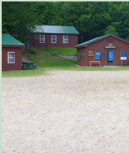
BARRY CAMP STAFF PHOTO

Do you know a landscape architect who could help Barry Camp out by providing landscaping plans? Work is needed to address drainage issues on the grounds between the buildings. We also want to bring this area back to grass. These improvements will enhance the overall natural look of the camp, reduce dust and dirt in the cabins and other buildings, and help keep the summer heat at bay. A landscape plan has not been initiated as yet. We are seeking a landscape architect who would be willing to donate their expertise.