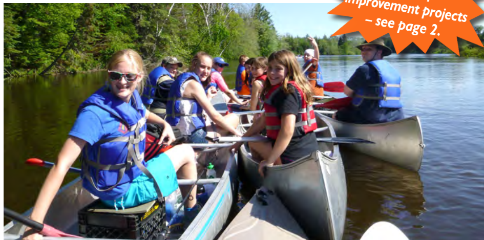
Campers explore the Androscoggin River by canoe.